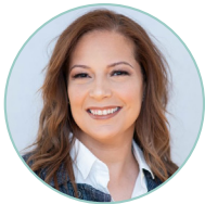
Angélica Infante-Green Commissioner of Elementary and Secondary Education Rhode Island Department of Education